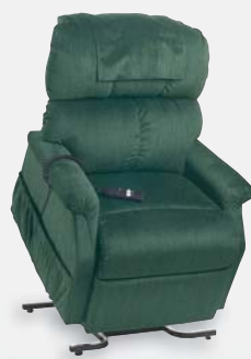
Comforter Large PR-501L