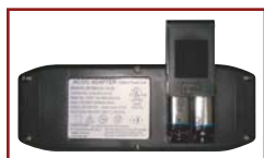
Battery Backup System

Sizes may vary depending on fabric, filling material, upholstery and carpet thickness. All measurements taken on concrete floor using levels and metal rulers.