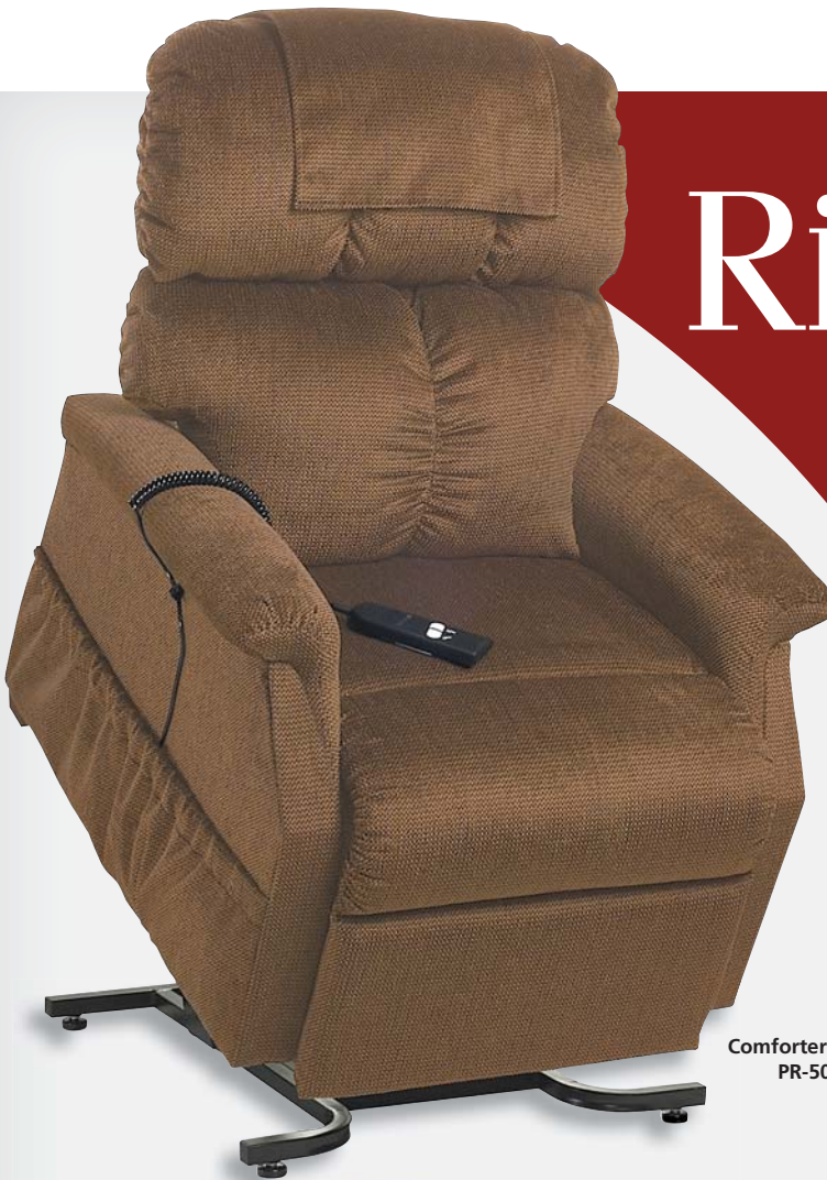
Comforter Medium PR-501M