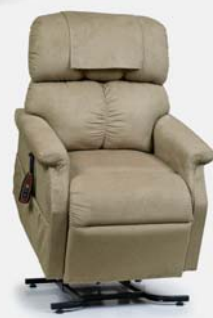
Comforter Small PR-501S