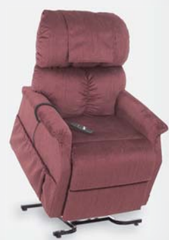
Comforter Tall PR-501T