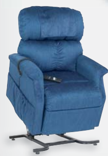
Comforter Junior Petite PR-501JP