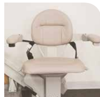
Larger seat and footrest for increased comfort.