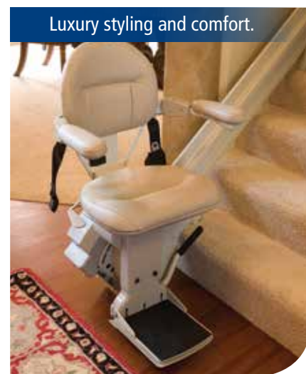
Luxury styling and comfort.