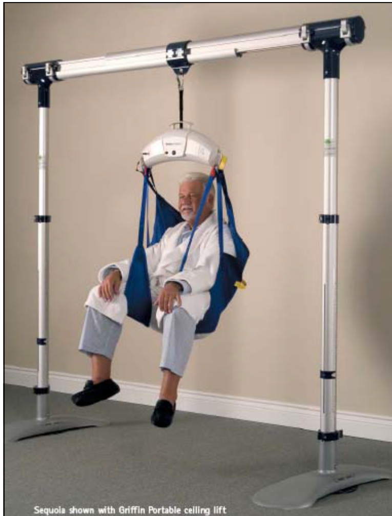
Sequoia shown with Griffin Portable ceiling lift