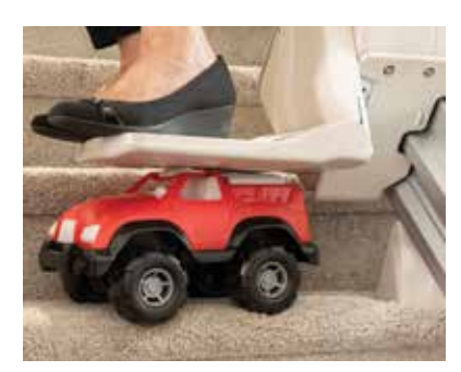
Sensors ensure safety.