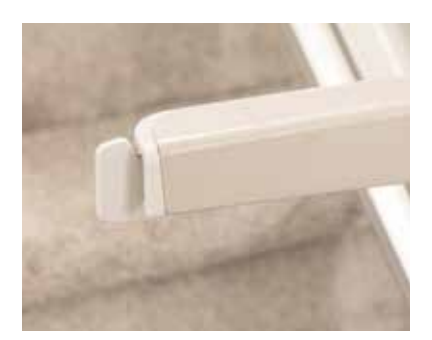
Ergonomic armrest control.