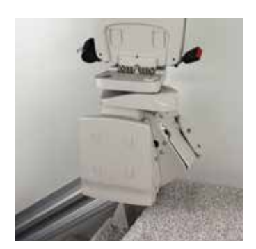
Power folding footrest automatically flips up/down when seat is raised/lowered. Arm switch control optional.