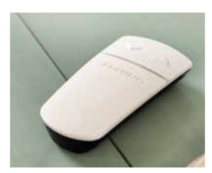
Two wireless call/sends allow remote control access.