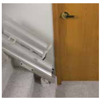
Manual or power folding rail for narrow hallway or when doorway is at the bottom of stairs. Manual operation or push button automatic.