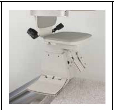
Power swivel seat for effortless exit. Armrest switch control or wireless call/send.