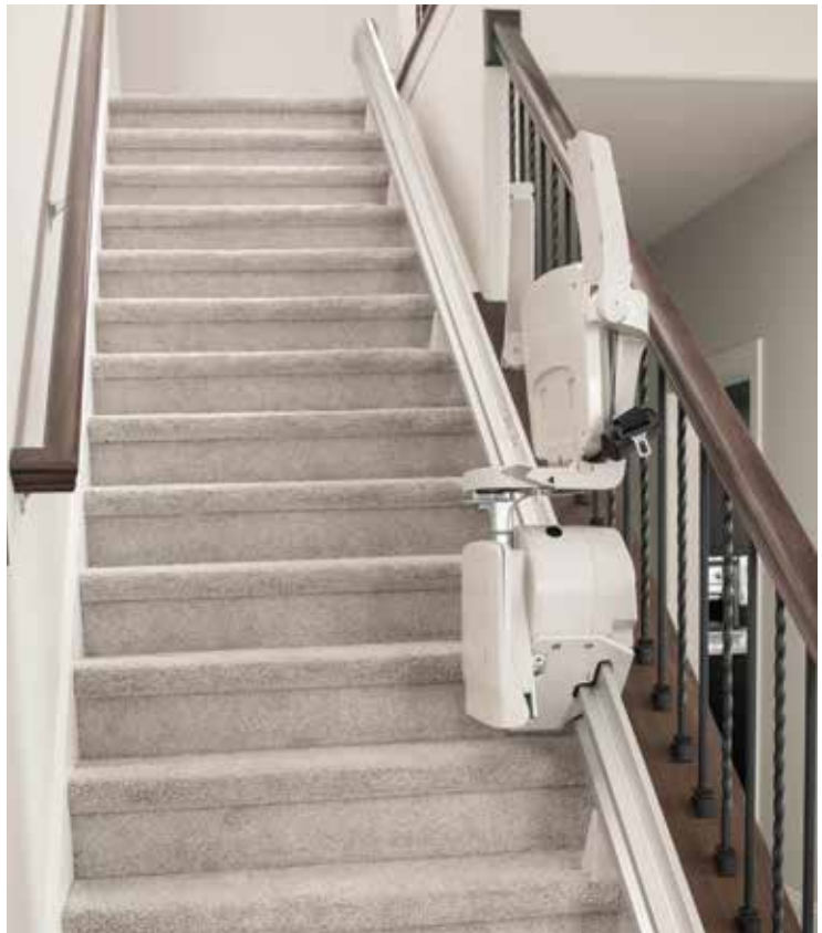
Compact design for open space on stairs.