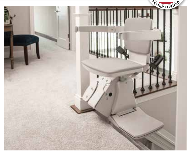
Offset swivel seat makes getting on/off easy.