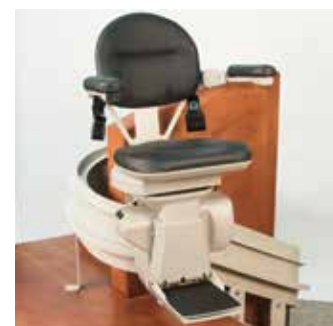
Mid-park and charge station for staircases with middle landings.