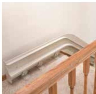
Top or bottom park position extends rail away from the staircase.