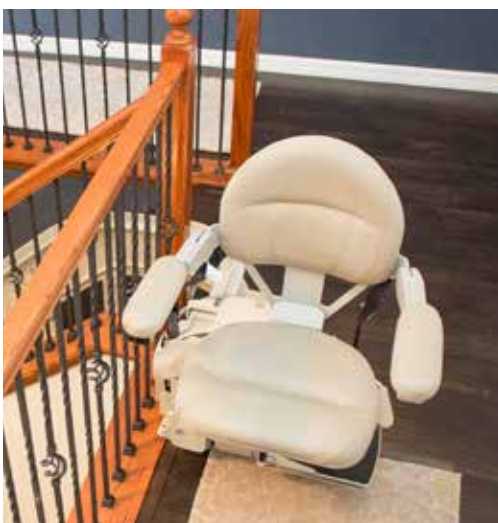
Offset swivel seat makes it easy to get on/off.