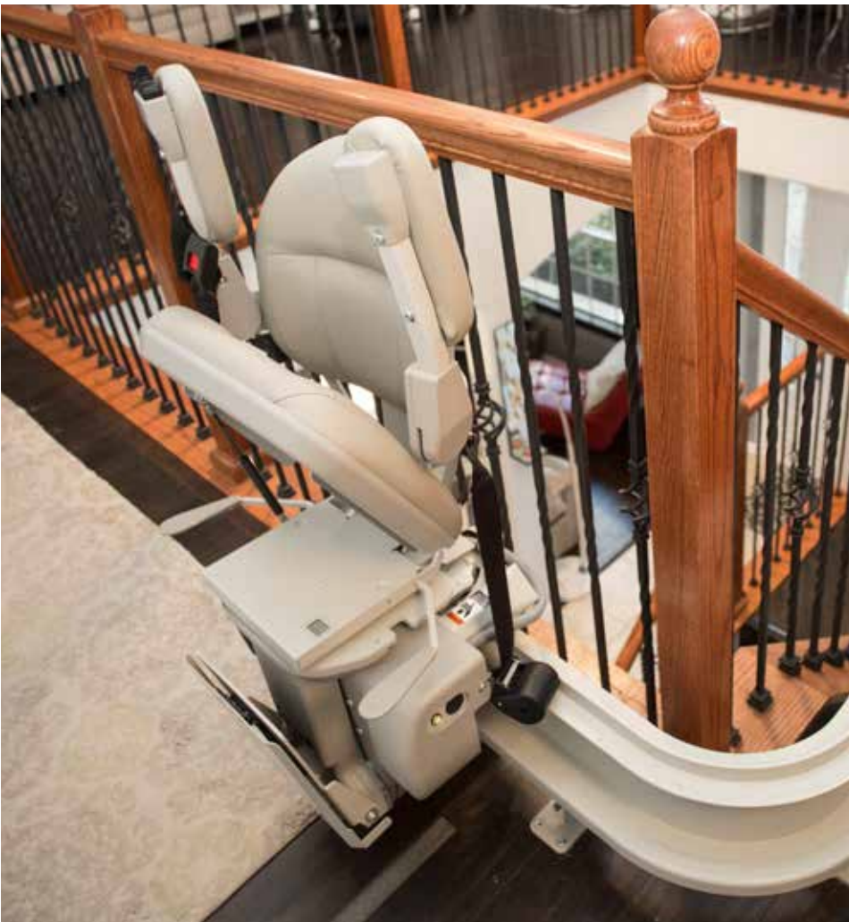
Custom made specifically for your home.