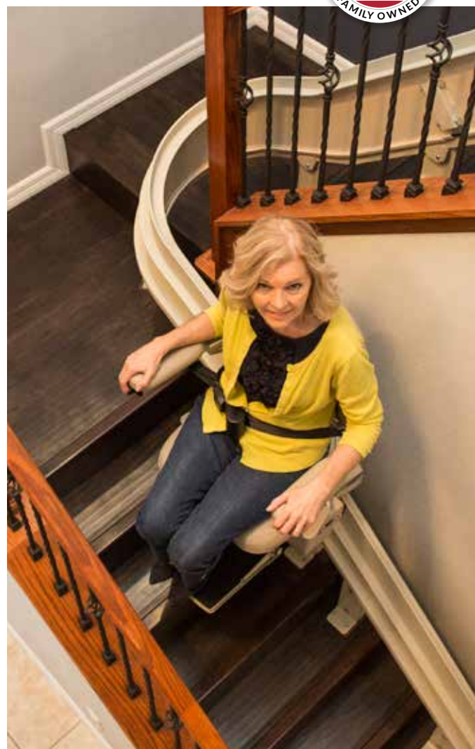
Crafted for a precision fit around curves.