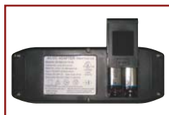
Battery Backup System

Sizes may vary depending on fabric, filling material, upholstery and carpet thickness. All measurements taken on concrete floor using levels and metal rulers.