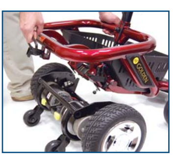
3. GP162 model only. Grasp the frame and locking handle; lift the handle to unlock, and lift the frame up and off the drive train.