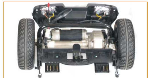
Quiet & maintenance free motor