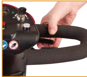
EZ Reach tiller adjustment