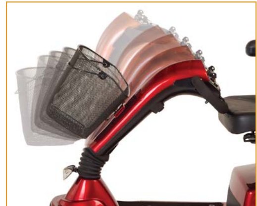
Patented infinite adjustable tiller