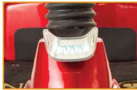
Angle adjustable LED headlight creates a wide path of bright light