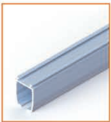
Regular Track Standard rail for most applications.