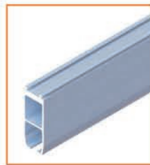
TrackPlus Our highest rigidity track for our longest free spans.