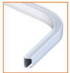
Curved Track With three angle options (22, 45 and 90 degrees), provides endless room layout options and is available in both standard and flush mount.