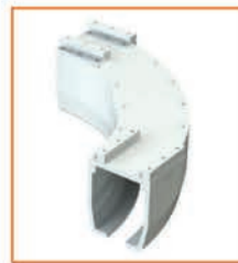
Quick Curve The smallest curve in the market only offered by Handicare to address tight corners and obstacle avoidance with a 6.5 in (165 mm) radius.