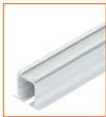
Flush Mount Track For the lowest-profile installation.