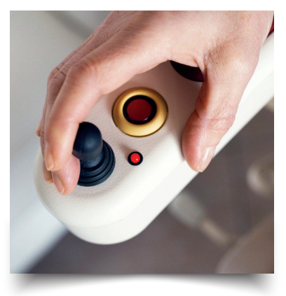
The easy-to-use joystick can be positioned on the left or right arm for maximum control and ensures a comfortable ride, every time.