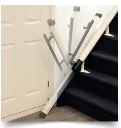
The Freecurve can be combined with a powered hinge or drop nose option to prevent the track from obstructing a doorway at the base of the stairs.