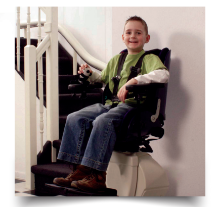
A special seat for small riders ensure a safe & comfortable ride no matter their size.