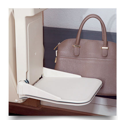
Surrounded by safety sensors, Handicare stairlifts are designed to stop if meeting an obstruction - keeping you safe and still on vour seat.